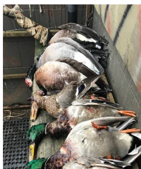
Good Days Hunt