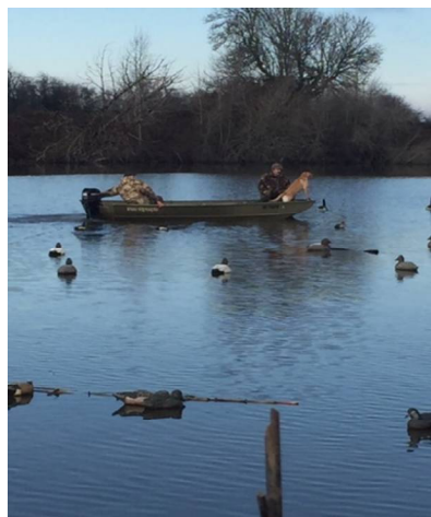
Moving logs from decoys.