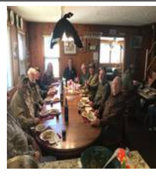
Lots of great Lunches